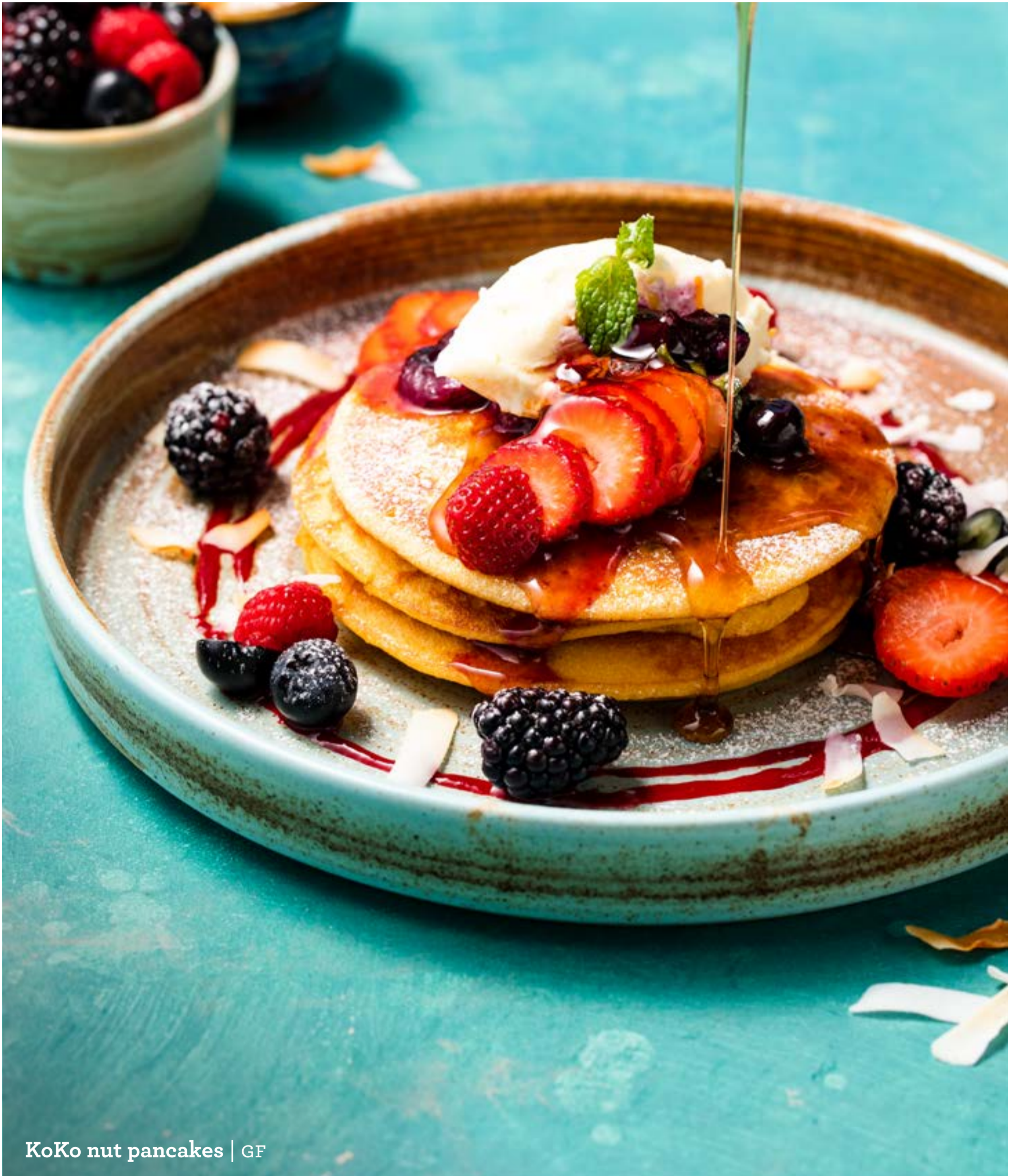
KoKo nut pancakes | GF

All prices are in AED, inclusive of 5% VAT and 7% Municipality fees. Please alert your server in case of any food allergies.